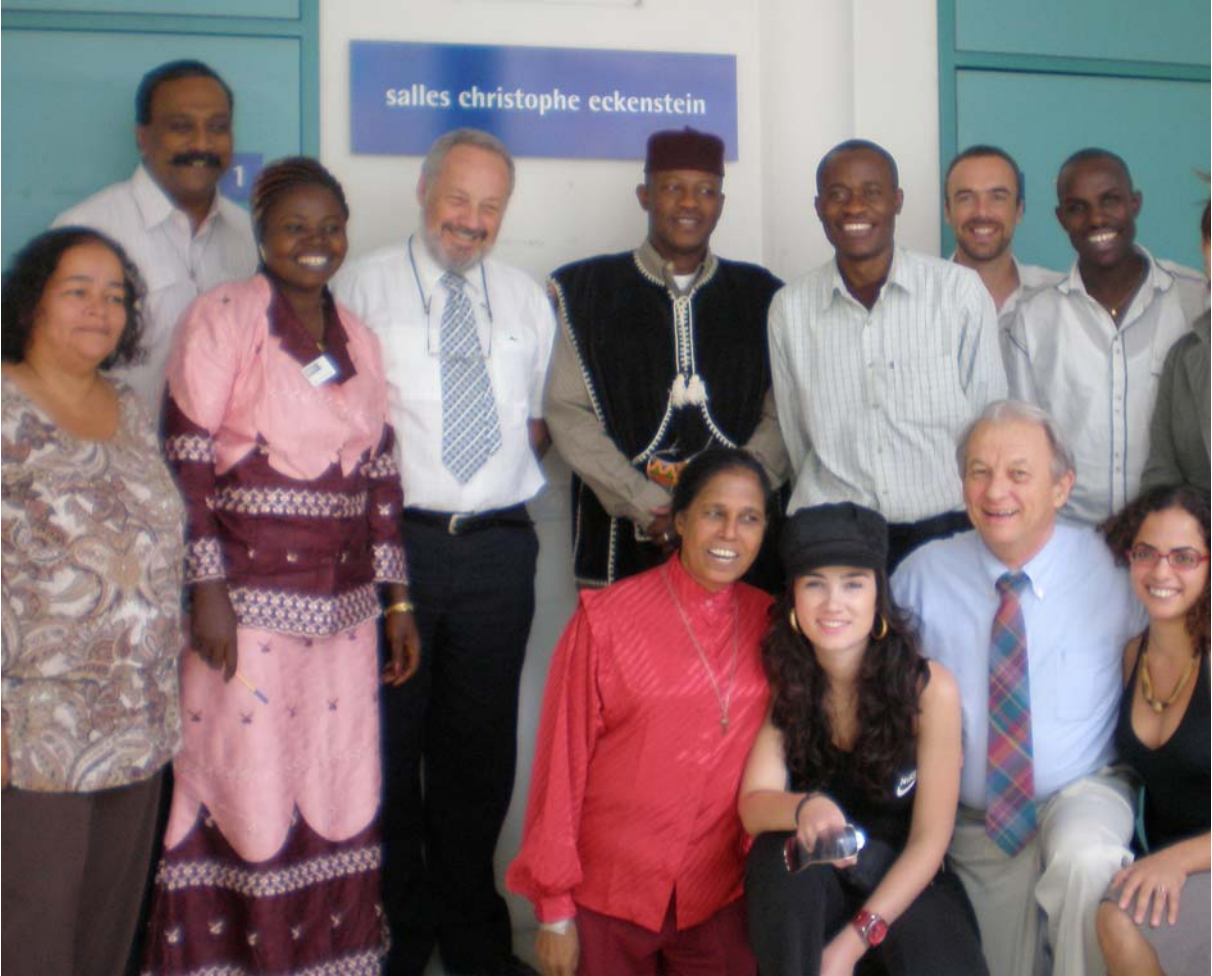
Seminar participants and members of the OMCT secretariat at the conclusion of the special procedures seminar