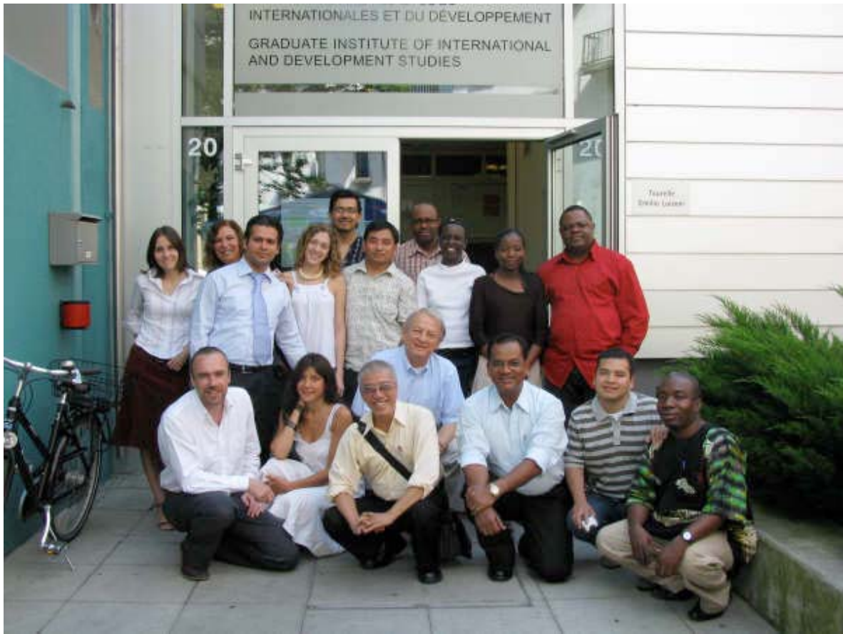
Seminar participants and members of the OMCT secretariat at the conclusion of the special procedures seminar, 27 June 2008.