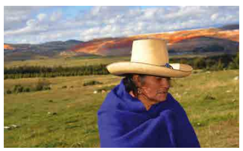
A woman, farmer, known as the woman who said "You cannot eat gold" (Peru).