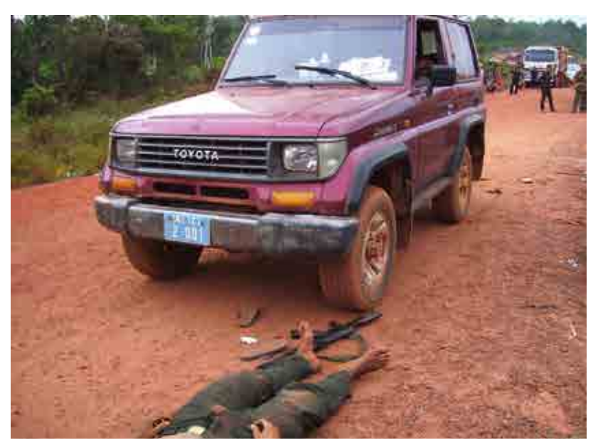
Photo taken a few hours after the killing of Chut Wutty (Cambodia).

operate with sufficient independence from the Government when hearing cases related to human rights, and do not demonstrate independence in their court decisions. Furthermore, courts are often controlled by local interests, and thus cases about major projects related to the local economy may be deemed as too "sensitive" for courts to accept<sup>88</sup>. Similarly, justice in Cambodia is highly controlled by the executive power, and criminal processes in Honduras have often been decided in favour of powerful economic interests instead of land rights defenders. Similar claims regarding the lack of investigation and independence of courts were made by organisations in many countries covered by the research.