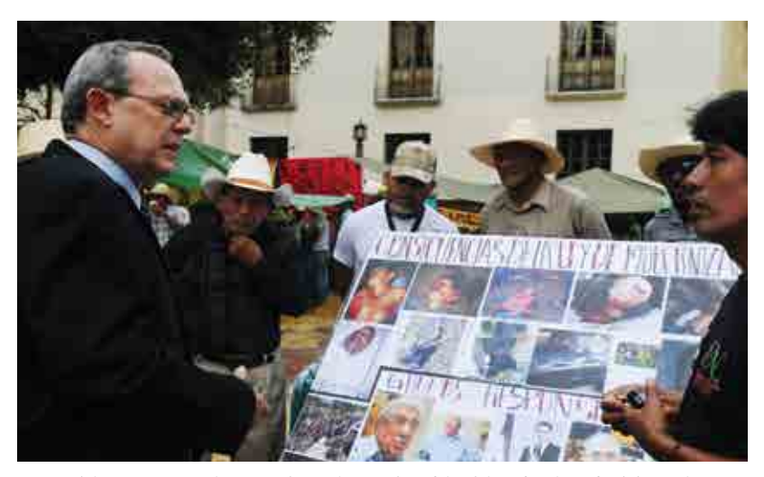
UN Special Rapporteur on the promotion and protection of the right to freedom of opinion and expression, Frank La Rue speaks with peasants from Bajo Aguan, in Colon department, during a visit in Tegucigalpa on August 9, 2012 (Honduras).