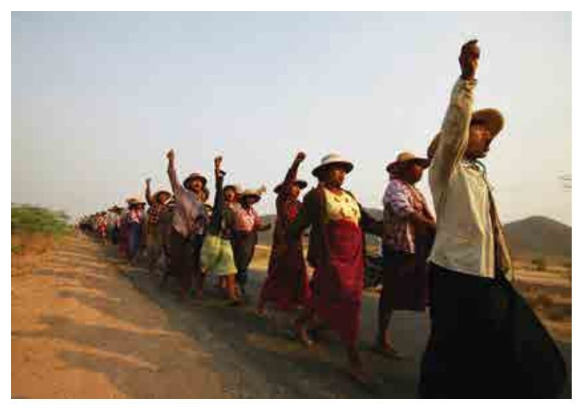
Villagers protest against a copper mine project in front of Lapdaung hill during a visit by Myanmar pro-democracy leader Aung San Suu Kyi in Sarlingyi township March 13, 2013.

This lack of protection has become a major cause for conflict when land and/or resources are grabbed without governments and economic actors caring to respect the human rights of those who live there. Some groups have been particularly vulnerable, such as indigenous peoples. Women, too, tend to be particularly vulnerable. Despite the emerging consensus that a right to land needs to be explicitly recognised and codified under international human rights law and despite ongoing negotiations for a declaration on the rights of peasants and other people working in rural areas, there is no human rights instrument explicitly referring to a selfstanding human right to land (with the exception of indigenous peoples). However land rights are instrumental to and may even be seen as a key component of several human rights that are protected under international law. Equally, human rights law as well as treaties on the environment and indigenous peoples do increasingly provide obligations to consult affected communities, an element that is key to a human rights approach to development and plays and important part in preventing social conflicts.