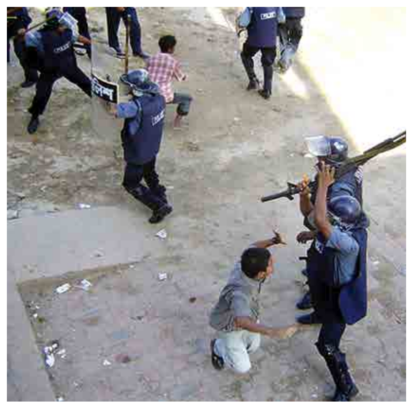
Police disperse members of the Oil, Gas and Port Protection Committee during a protest at the Phulbari coal mine in Dinajpur, 26 August 2006. At least five people were killed and over 50 hurt (Bangladesh).

views of the community as a whole. The NCP accepted to examine the case and suggested a mediation (confidential while in progress). The NCP nevertheless noted the limitation of the approach, "that the complainants' objective for mediation is the company's withdrawal from the Project, but notes that the NCP offer does not make any judgement about what the outcome of mediation should be" 50.