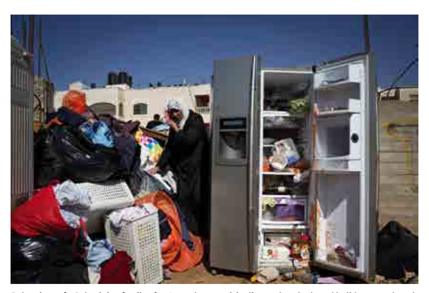
Belongings of a Palestinian family after Jerusalem municipality workers had used bulldozers to demolish a residential building in an East Jerusalem neighborhood on October 29, 2013 of Beit Hanina, West Bank. The building was demolished after Israeli authorities claimed that the the structure had been built without the necessary authorisation.

In 2007, the Inter-American Court of Human Rights (IACtHR) recognised similar rights to customary lands to non indigenous traditional communities in the landmark decision Saramaka v Suriname. The Saramaka are descendants of self-liberated African slaves who have been living on their lands since the early 1700s. This community lives in Suriname in a traditional way, by fishing, hunting and woodworking, and their relationship with the land is economic, spiritual and cultural. The Constitution of Suriname, adopted in 1986, specifies that all non-titled lands and resources belong to the State. In the 1990s, Suriname granted logging and mining concessions to companies within the territory of the Saramaka, without seeking their consent. Loggers devastated their territories, which led them to get organised and petition the IACtHR in 2000. They won their case in 2007 and the court required that "The State shall delimit, demarcate, and grant collective title over the territory of the members of the Saramaka people, in accordance with their customary laws, and through previous, effective and fully informed consultations with the Saramaka people". The Court argued the Saramaka share special relationship with their ancestral territory and have their own norms and traditions, much like indigenous peoples, thus they have the same rights, including over their