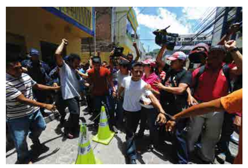
Handcuffed peasants of Bajo Aguan, Honduras, are escorted by policemen as they are transferred in Tegucigalpa on August 22, 2012, while union members demand their freedom. At least 30 peasants of Bajo Aguan were arrested during this protest.