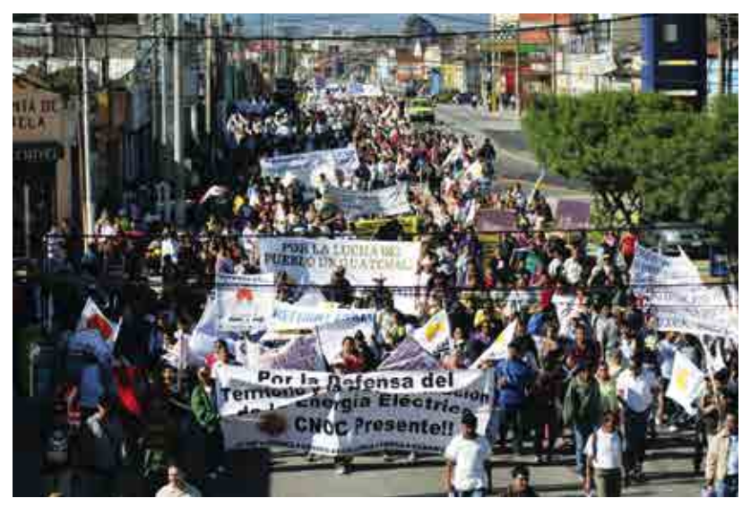
Demonstration against the Tumulos Bill (Guatemala).

constitutes a decisive step in the condemnation of the arbitrary use of anti-terrorist laws and other criminal legislations against land rights defenders in Chile and elsewhere on the American continent<sup>58</sup>