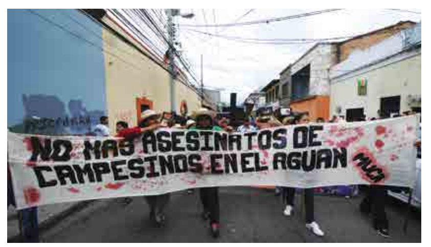
Members of the Peasant Unified Movement (MUCA) of Bajo Aguan, carry mock coffins bearing pictures of murdered mates in land conflict clashes (Honduras).