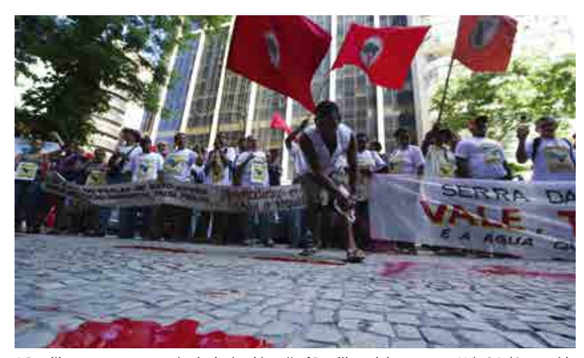
A Brazilian peasant sprays red paint in the sidewalk of Brazilian mining company Vale S.A. (Companhia Vale do Rio Doce) headquarters during a demonstration against damages to environment on April 18, 2012 in Rio de Janeiro (Brazil).