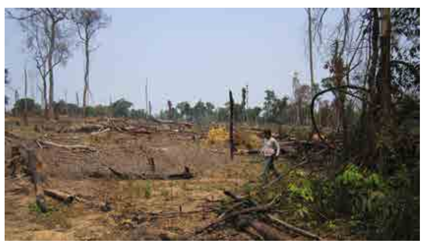
Prey Lang, primary forest in central Cambodia was badly cut (due to the infamous Economic Land Concessions and illegal logging).

in many cases, been criticized for being conducive to human rights and environmental abuses, such as forced evictions, environmental degradation, etc. Investment agreements also need to be deeply revised in order to ensure they do not hinder the protection of human rights. Such agreements typically grant considerable protection for investors without corresponding duties and responsibilities towards affected communities. Often, they contain investment arbitration clauses allowing investors to directly sue States and free them from domestic jurisdictions. Such arbitration mechanisms have been criticized for their lack of transparency and for their lack of due consideration to international human rights law. The obligations of investors are under-regulated in the current framework of international investment law. Such treaties even create a legal regime that accelerates the rush for land. These agreements reduce the ability of States to adopt protective measures and policies benefiting the rights of local land users. In Zimbabwe<sup>18</sup> and South Africa for example, investment treaty protection has served investors to challenge State initiatives fighting discriminatory