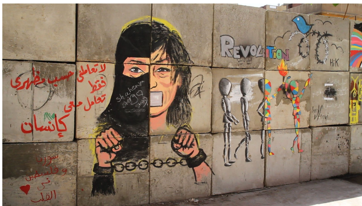
Pro-women's rights graffiti in Cairo by human rights defender and graffiti artist Mira Shihadeh. "Don't treat me according to my appearance only; treat me like a human being".