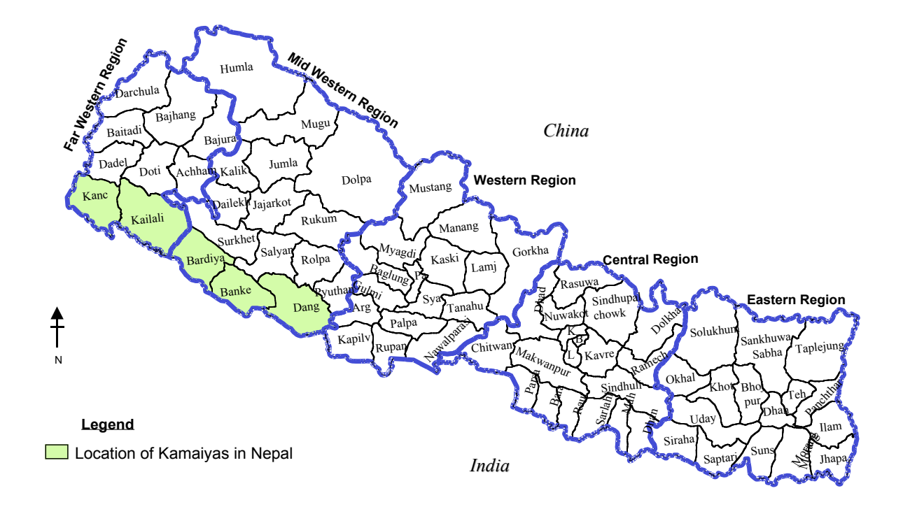
Annex 1: The Map of Nepal Showing Kamaiya Habitation