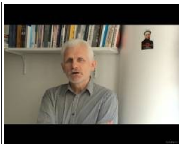
BELARUS: Ales Bialatski, Chairman of the Human Rights Centre Viasna, about searches conducted at his home, and the Prosecutor General's Office official warning against himself

You can see the first series of such testimonies on the situation of human rights defenders in Belarus, Colombia, Kyrgyzstan, Turkey and the DRC at the following links: