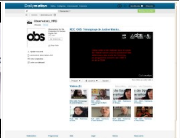
SEE ALL THE VIDEOS FROM THE OBSERVATORY FOR THE PROTECTION OF HUMAN RIGHTS DEFENDERS (FIDH-OMCT) ON DAILYMOTION