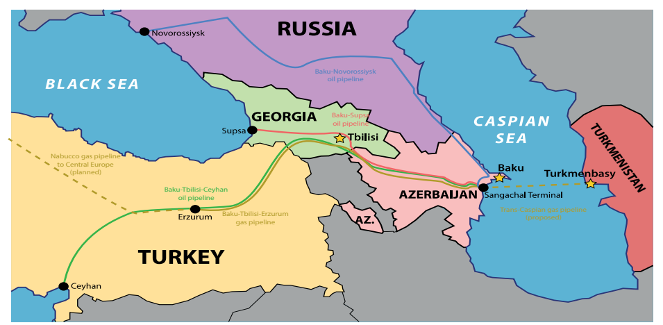
{\it Map\ of\ the\ existing\ and\ planned\ oil\ and\ gas\ pipelines\ from\ Baku.\ http://commons.wikimedia.org/wiki/File:Baku\_pipelines.svg @\ Thomas\ Blomberg}

The increasing loss of foreign diplomatic influence over Azerbaijan is an alarming factor as well. This loss of influence is inversely proportional to the growing dependence of the West towards the Azeri oil and gas, transported to the West since 2006 through the Baku–Tbilisi–Ceyhan oil pipeline and the Baku–Tbilisi–Erzurum gas pipeline, bypassing Russian territory.